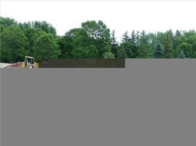
3) Reconstruction Continues