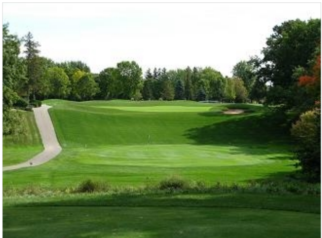
6) Completed New No. 7 Green