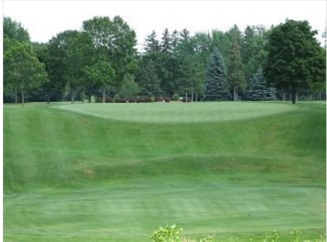
1) Old No. 7 Before Reconstruction

Everyone agrees that the project was a huge success, and members cannot wait until spring of 2009 to test the new green!