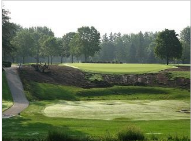
2) Beginning Reconstruction Work